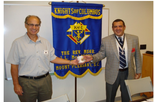
KNIGHTS OF COLUMBUS East Cooper Council 9475

HARBOR CRUISE Saturday November 2, 7:30 to 9:30 The General Beauregard - Patriot's Point