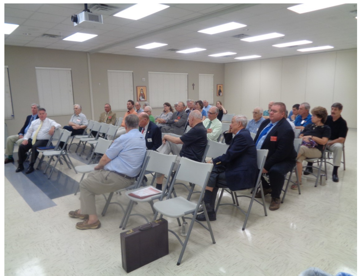
Above are the Knights and Wives in attendance of the Addiction Forum. We gained a wealth of very good information during the Forum and with a question and answer session afterwards. We learned that there are drugs out there so strong that just dust residue can kill you. There are thousands dying from drug overdose every year and much more.