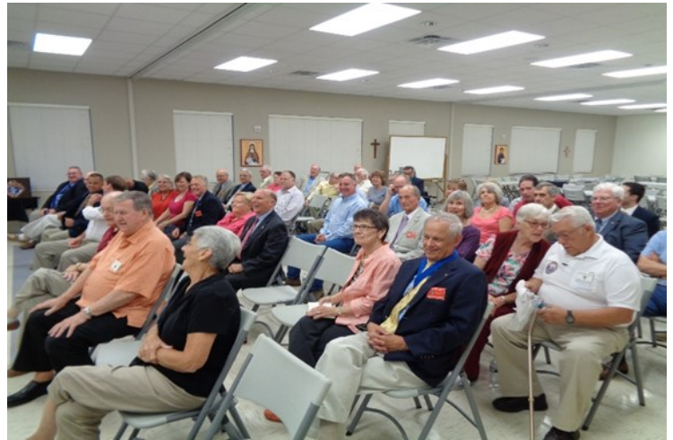
Above are the Knights and their wife's and visitors that attended our panel discussion.