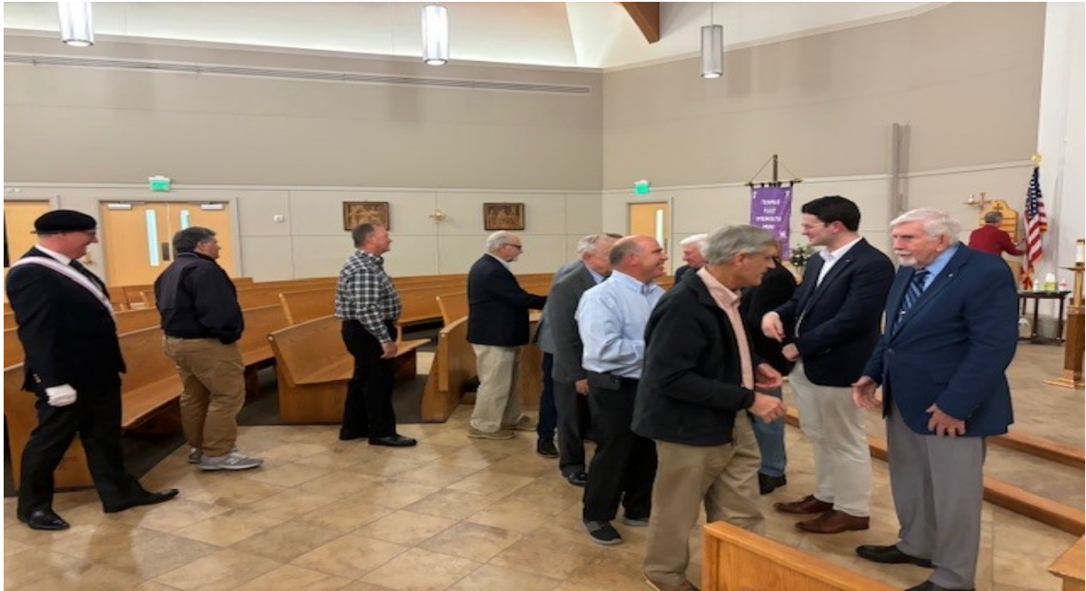
Above our new Brother Knights are lined up and being congratulated by all Brother Knights.

The exemplification was held before our regular meeting in the nave of St. Benedict's Church October 17, 2024