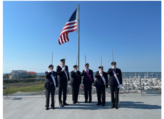
Members of the Assembly 3243 Honor Guard aboard the USS Yorktown after posting the new American Flag