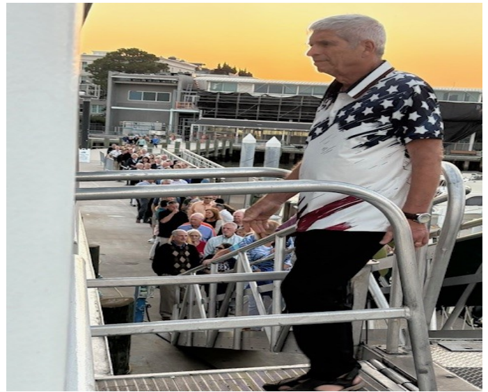
Here we have our guest boarding the vessel you can see they are from the beginning to the end of the pier.