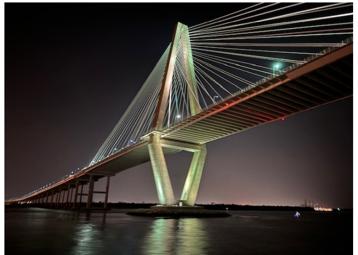
If you missed it, it was a beautiful night in the harbor.