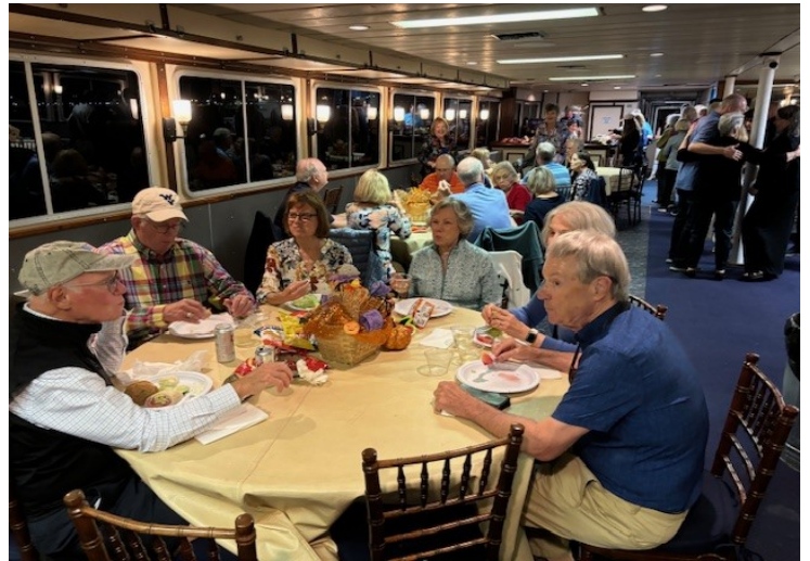
Our guest cruising enjoying their meal.