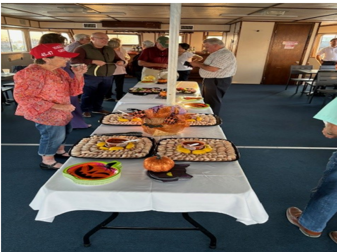
When you entered the vessel there were two tables with peeled shrimp, cocktail sauce, and a cheese tray.