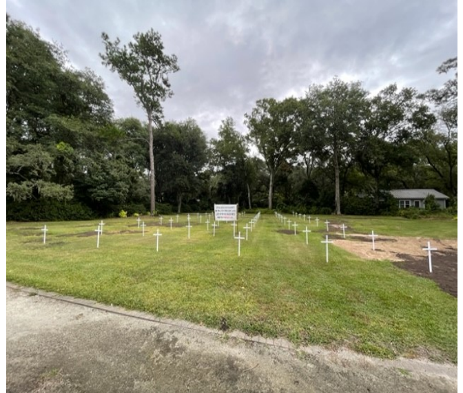
The above crosses represent a million babies each lives lost.