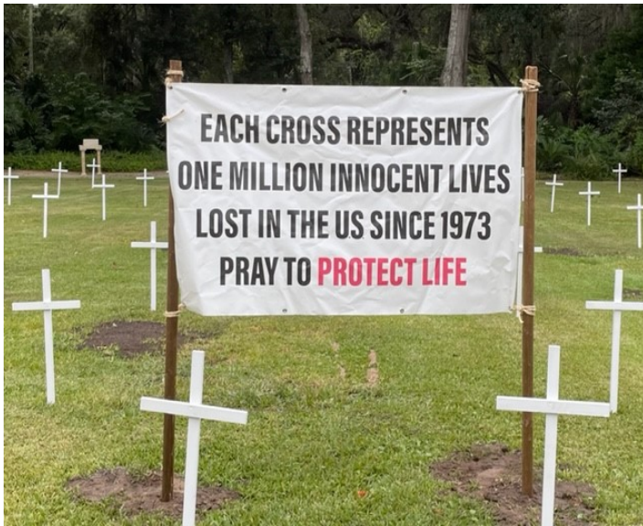
On the Altar Garden of Christ Our King the above banner explains the Loss each year of innocent lives.