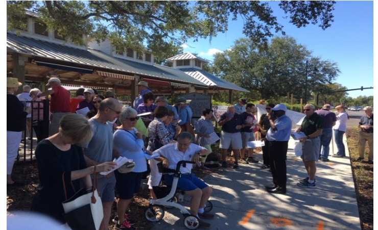
There were over 50 participating in the Rosary Rally