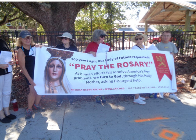
100 years ago our Lady of Fatima Requested we Pray the Rosary