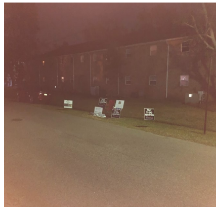
Display of signs to end abortion