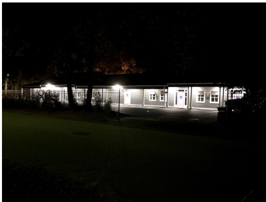
Abortion Clinic where we pray for the end of abortion