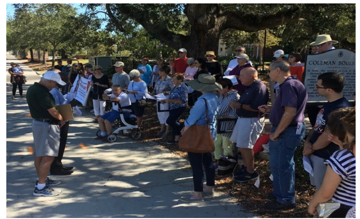
Brother Knights, Family, Parishioners and Friends Praying the Rosary