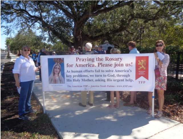
Praying the Rosary for America

To commemorate the Anniversary of the Fatima Miracle of the Sun was held Saturday, October 12th in front of Moultrie Middle School.