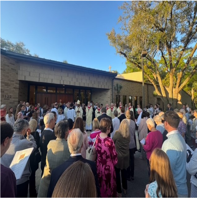
The Bishop top center with the miter and crosier is addressing the parishioners at the start of the dedication outside of the Church.