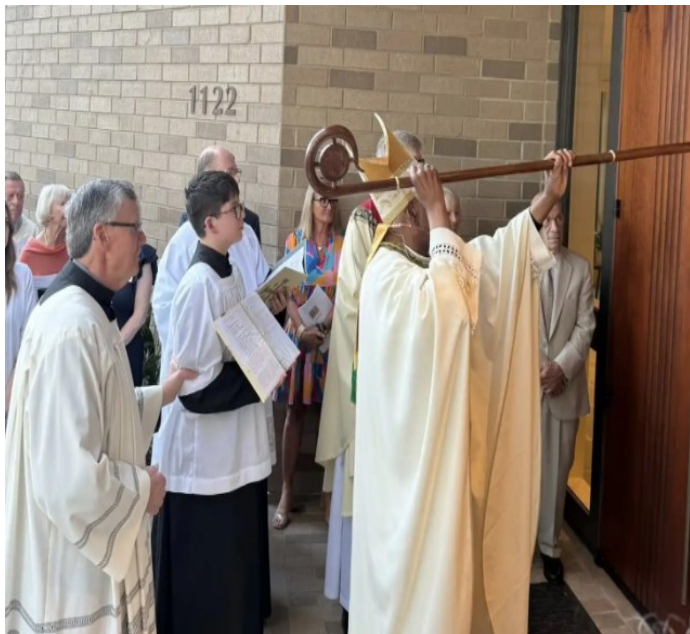
Above we have the Bishop knocking on the church door with his crosier to open the doors.