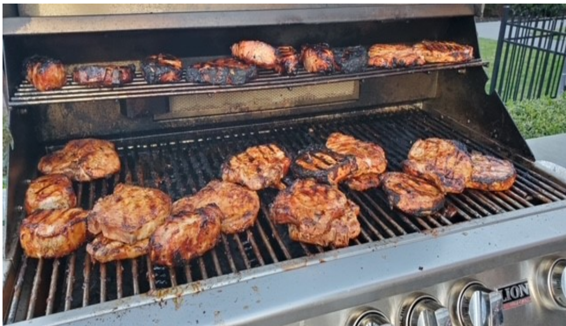
Here's a picture of the mouthwatering, juicy pork chops on grill with Don Campbell's secret sauce on them that is main part of meal they cook for them.