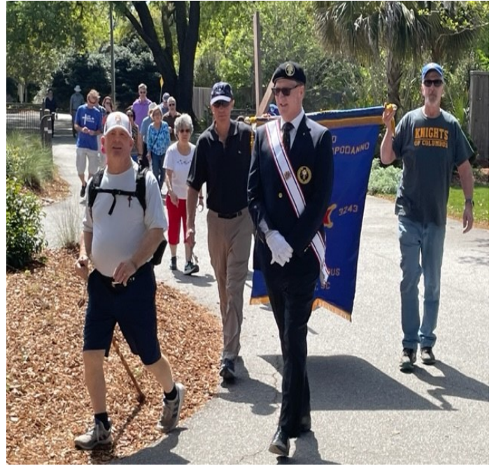
The Cross Procession made it back to COK Church grounds, walking through the remote gate headed to the Altar Garden, where the Rosary will be said.