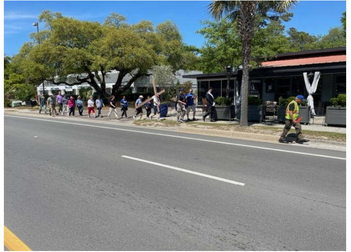
Cross Procession continuing its walk back to COK Church just passing carwash on Coleman Blvd. Carrying Cross are Don Campbell and Deacon Kevin Campbell.