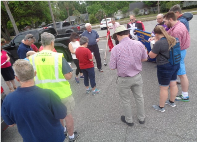
Prayer before Cross Procession started