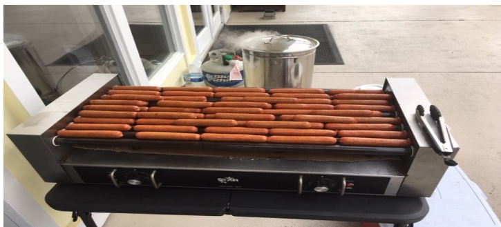
The hotdogs are ready!