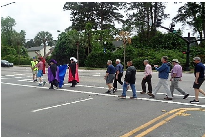
The Cross, Assembly 3243 Colorguard and Cross Procession are crossing Houston Northcutt Blvd.