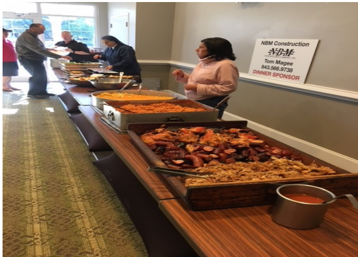
Above is a wealth of good food salad, macaroni and cheese, rice and kielbasa sausage, grilled chicken, grilled sausage and pulled pork plus refreshments. A good time was had by all!