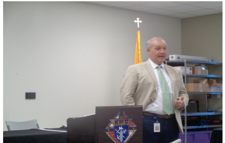
Mayor Will Haynie gave our council a good insight on the past, present and future growth of Mt. Pleasant's. He had a wealth of information and answered all questions.