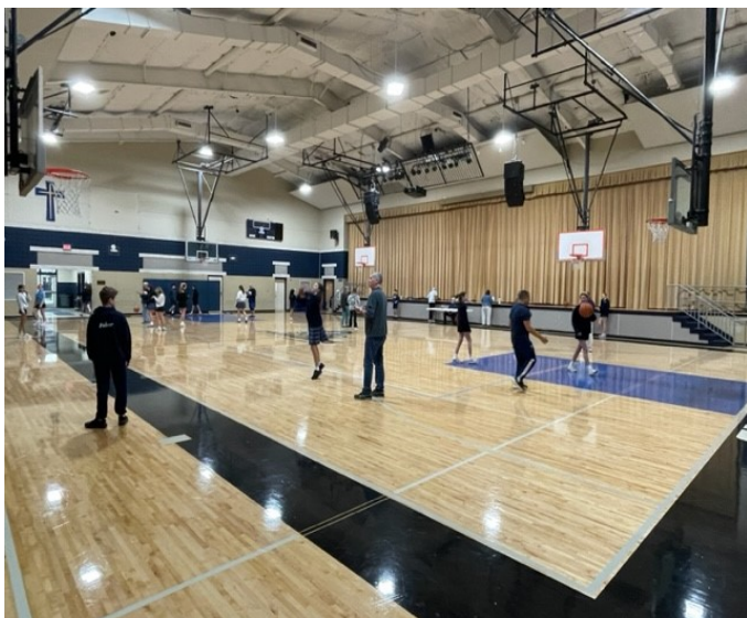
Here we have all 6 baskets being monitored at one time.