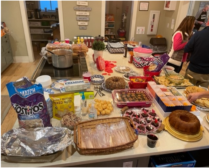
Here's a counter full of great food; Fish stew, hotdogs, hamburgers, salads, dips, all kinds of pastries and lots of beverages.