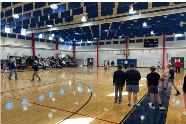
We were officiating at 5 baskets at a time.