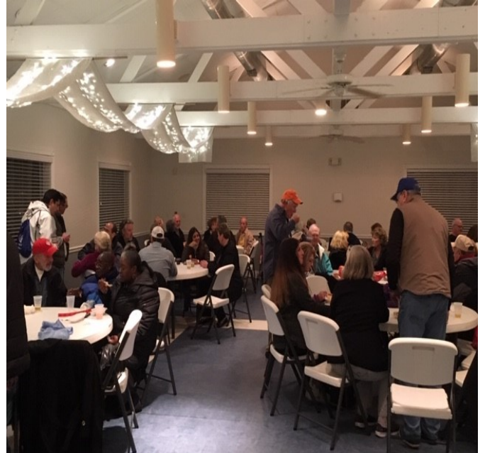
Folks just enjoying each others company.