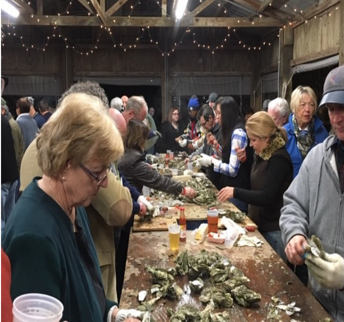
Enjoying eating the Oysters.