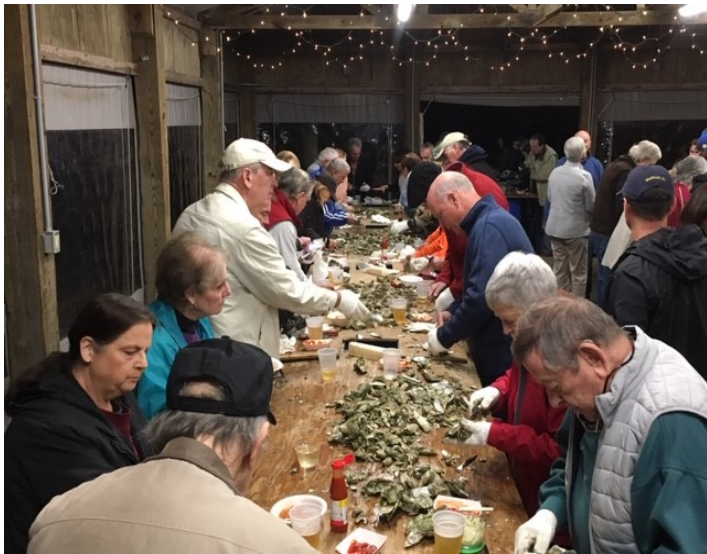
Oysters are so good no one looking up.