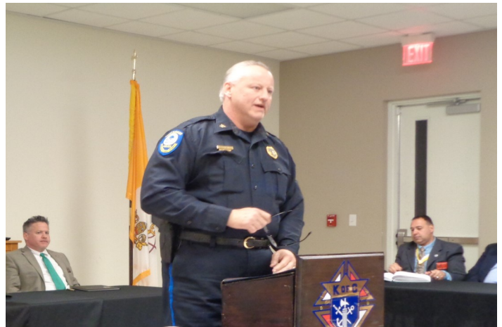
The Chief gave us a great talk on many topics his Officers expectations, traffic, drugs, crime, Mt. Pleasant growth and because of growth the need for more Officers.