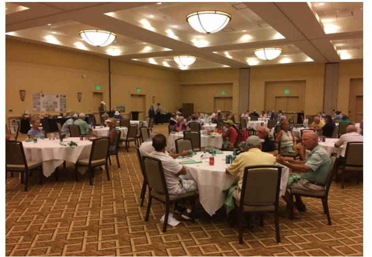
After a great meal golfers socializing a waiting their door prize number to be called.