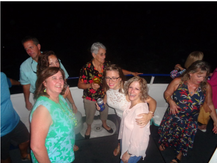
Lots of fun cruising on the fantail under the beautiful night stars.