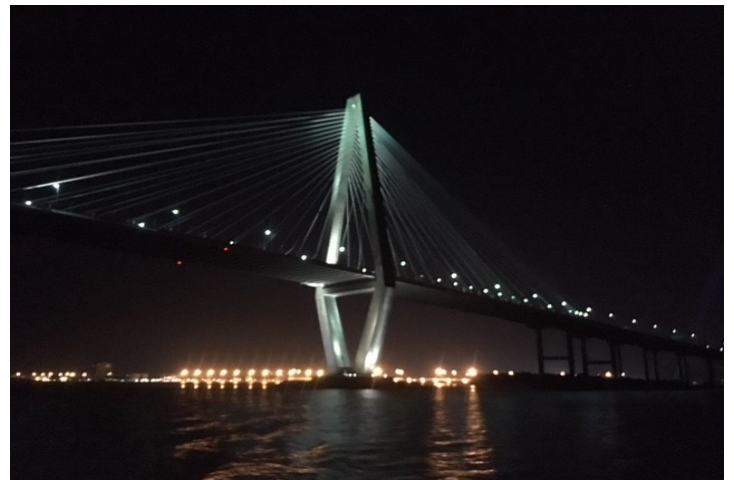
What a night for viewing the Harbor's beautiful scenery.