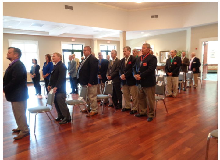
The Installation of the above Officers standing in a sign of the cross, after being installed into office on Tuesday June 21 in Christ Our King Life Center, Grace Hall 6 PM and dinner followed at Liberty Tap Room and Grill, 1028 Johnnie Dodds Blvd. at 7 PM. It was a good time for all that attended.