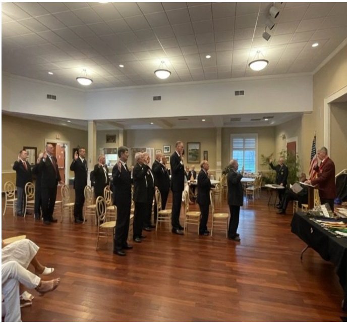
New Officers being sworn in with right hand raised while standing in a shape of a cross.