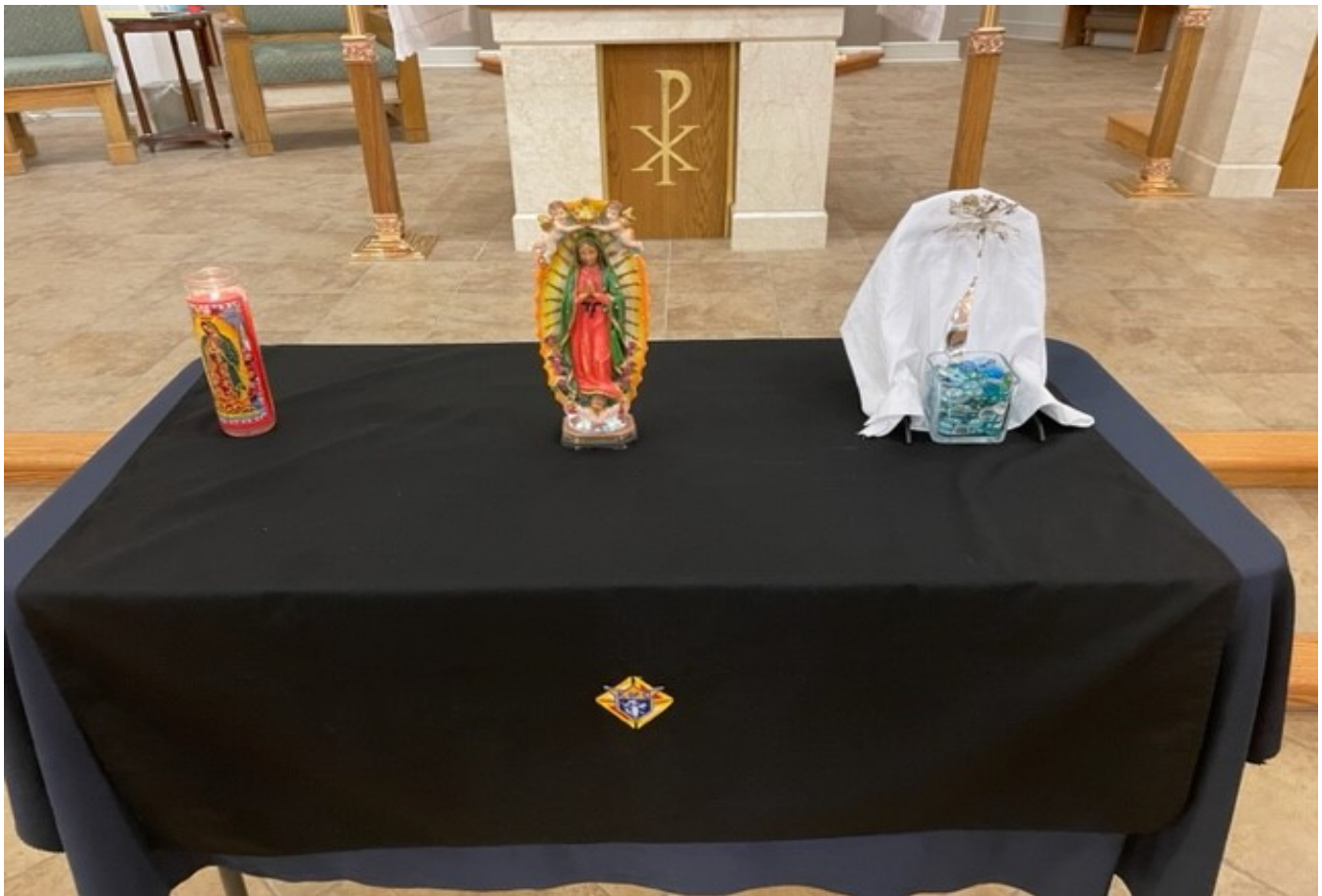
Above is the full display of the Silver Rose during the Silver Rose Service Left a lit candle with picture of Our Lady of Guadalupe, center statue of Our Lady of Guadalupe and the Silver Rose.