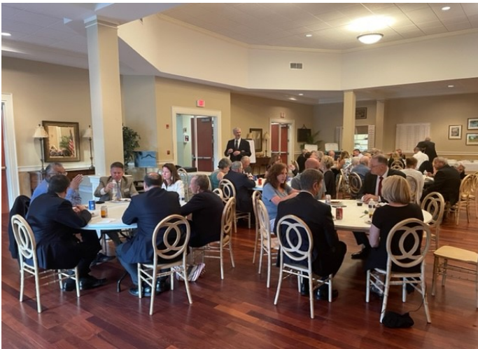
After Installations a great pot luck dinner was had by all.