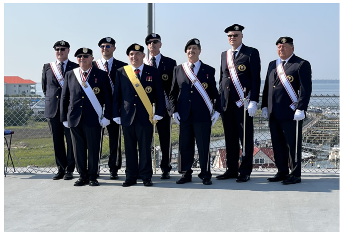
Knights of Columbus Assembly #3243 Honor Guard Team.