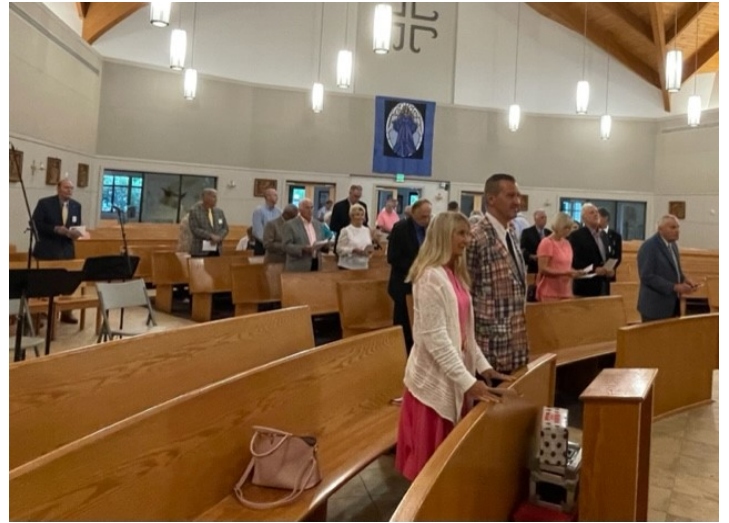
Above the Silver Rose Prayer Service was well attended.