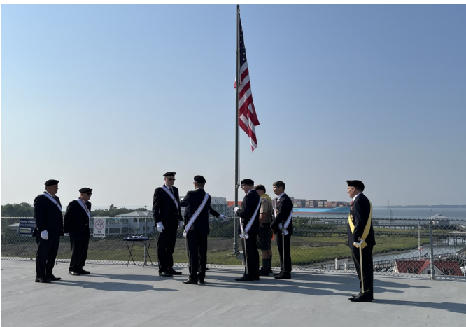
Retiring the old flag.