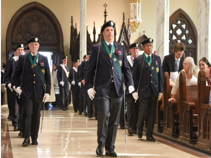
Above is Knights of Columbus Honor Color Guard leading ordination procession into the Cathedral of St John's Church downtown Charleston S.C.