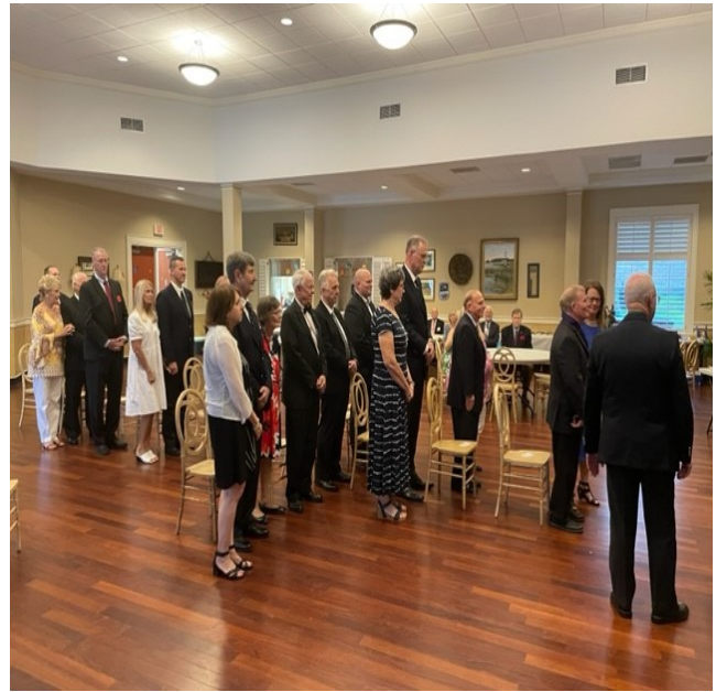
Newly sworn in Officers are standing with their wives standing beside them.