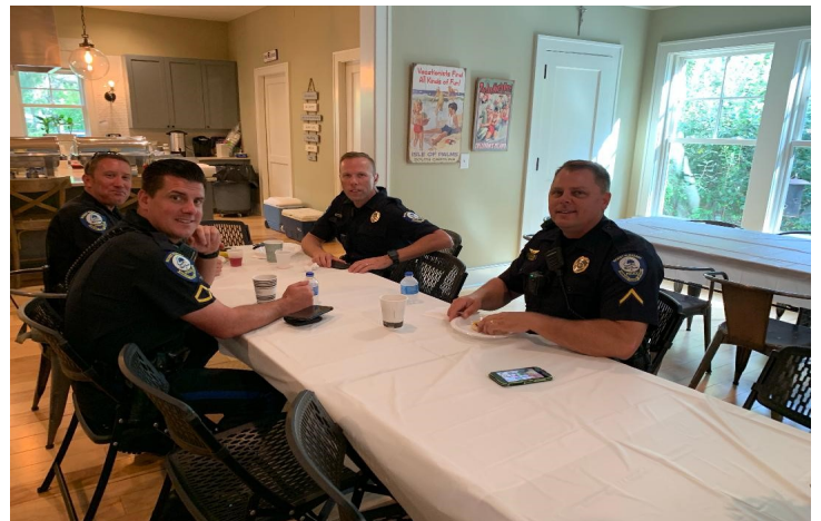
Mount Pleasant Police arrived and enjoyed the Brunch