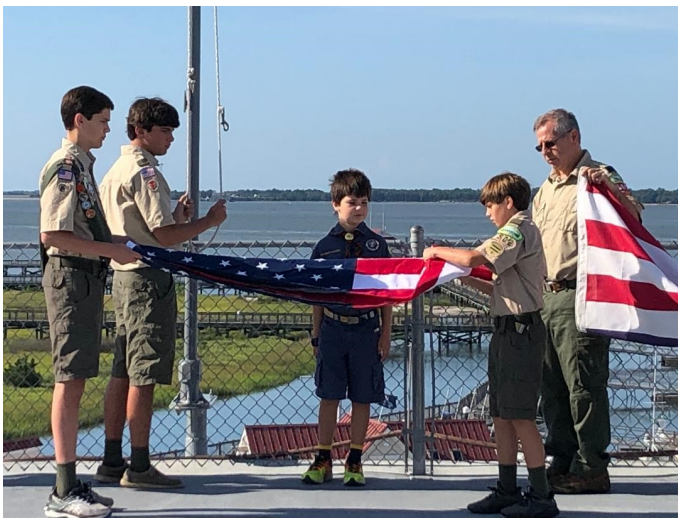
Scouts retired the old flag and in the process of folding