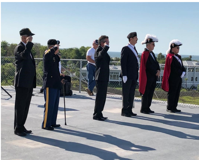
4th Degree Sr. Knights saluting the flag