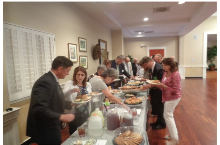
Then it was time to eat. We had a great catered buffet .