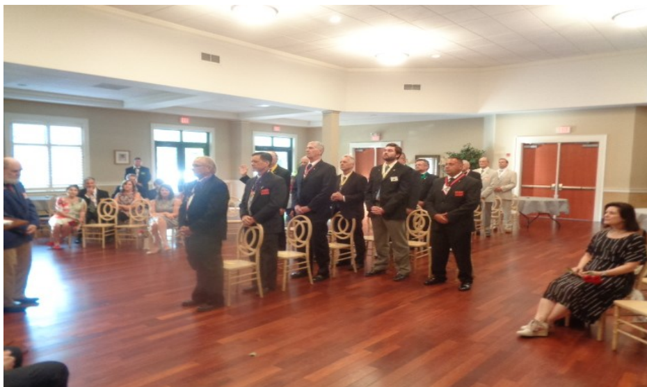
Above the Officers for 2019-2020 stand in the form of a cross before being installed.