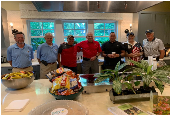
Food is ready kitchen help standing –by