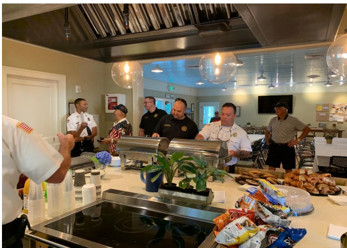
First responders arrive Fire Fighters