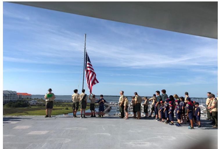
Scouts raising the new flag