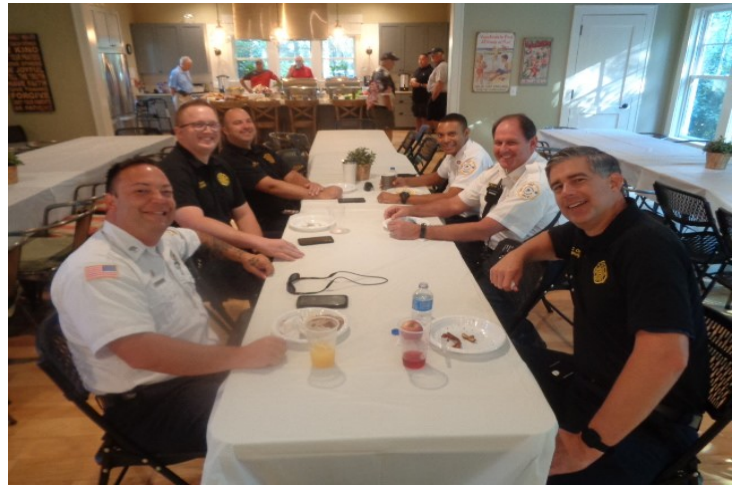
Fire Fighters very appreciative