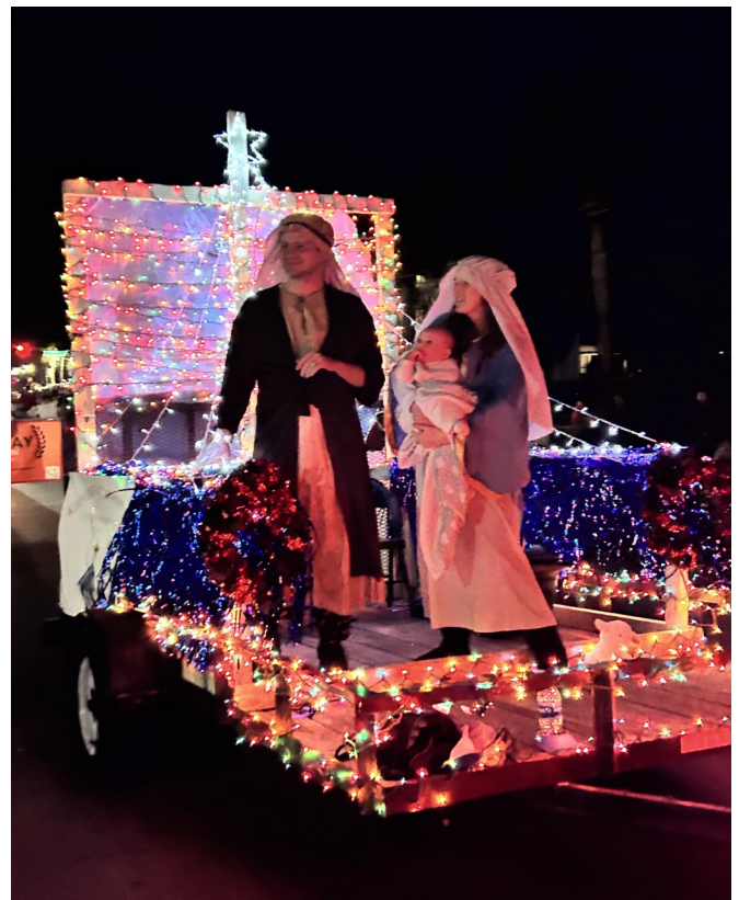
Above we have Joseph and Mary holding baby Jesus .