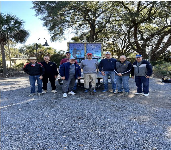
Above are the Brother Knights that put our Christmas float together.