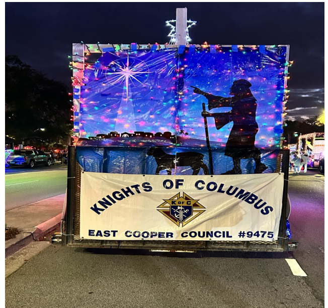
A great scene of a shepherd on the back of our float with our Knights of Columbus banner