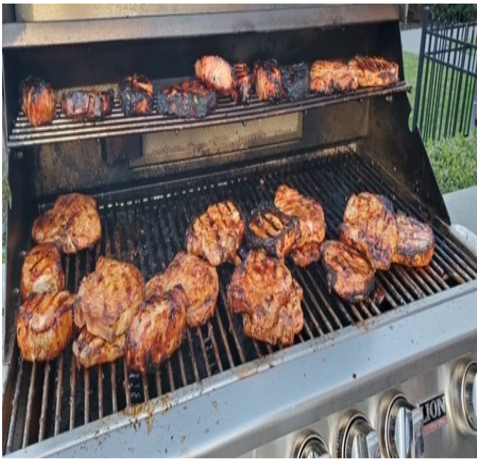
Mouthwatering, Juicy Pork Chop on Grill