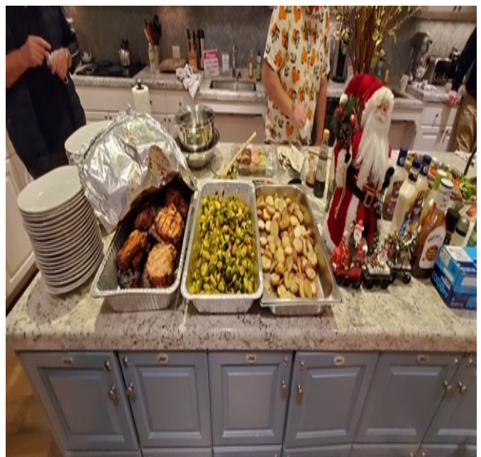
Delicious dinner ready to be served