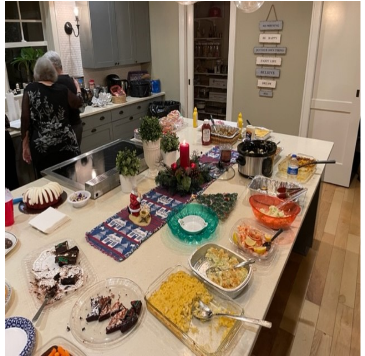
As you can see in the picture we had plenty of food Ham, Turkey all the side dishes and desserts everyone brought plus refreshments to drink.