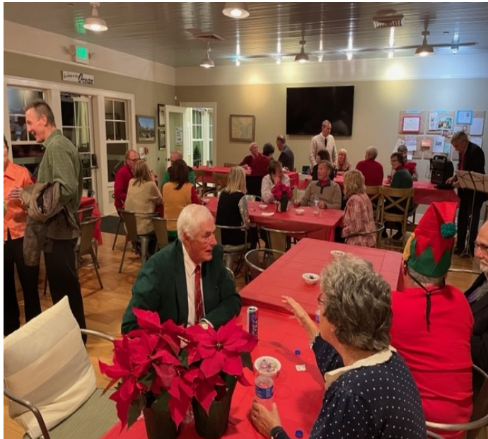
Everyone had a nice time visiting and singing Christmas carols.