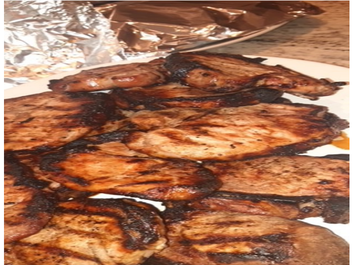
Look at the above mouth watering beautiful golden brown juicy pork chops prepared and served by the crew to the left.