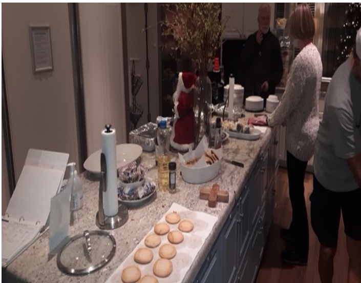
Above is the beautifully set serving table.