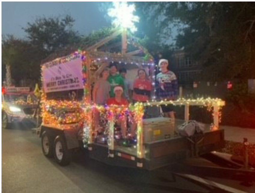
Above is our Keep Christ in Christmas and it's OK to say Merry Christmas float in the parade with Christ Our King Youth Group riding on it.