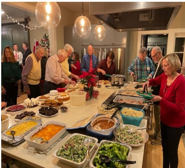
What a great festive meal we had by what was provided by the Knights and dishes brought by those that attended the party. We had plenty to eat and lots of great desserts.