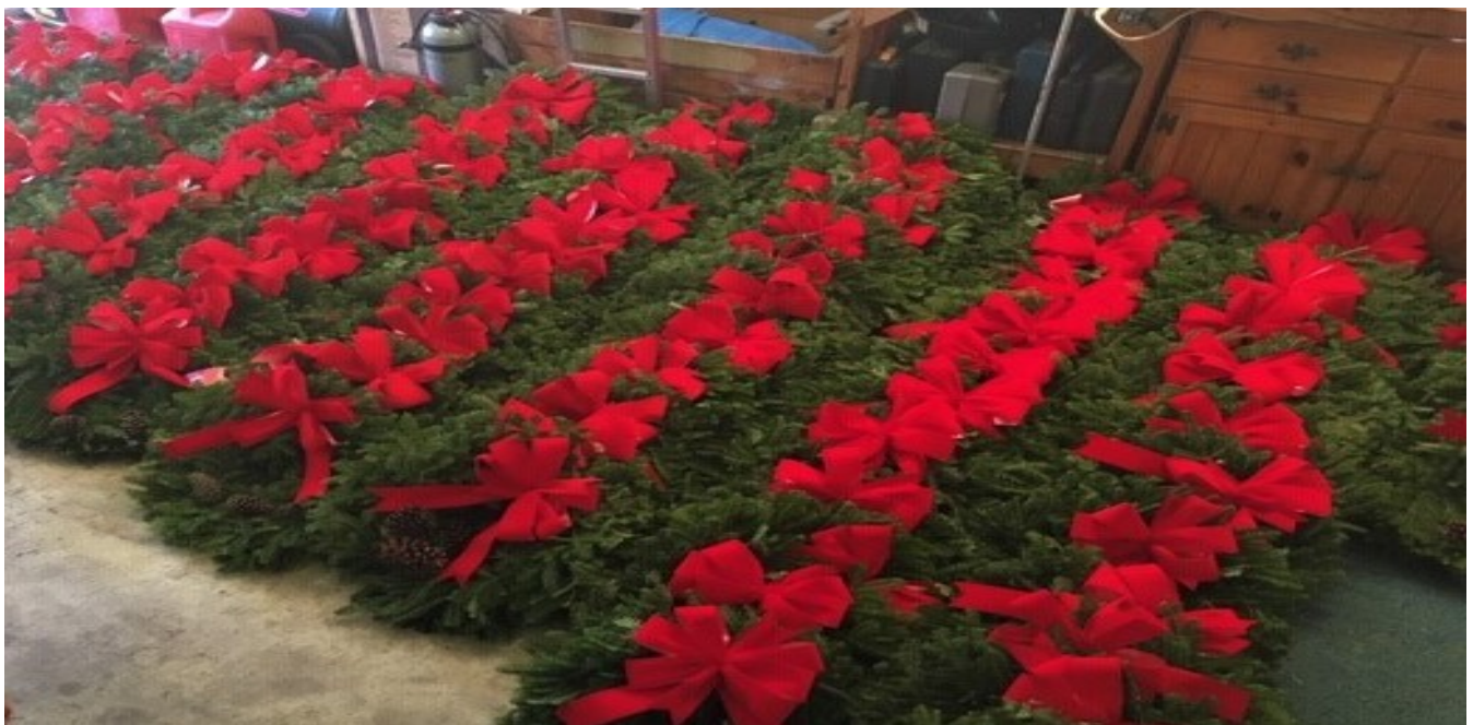
A winter wonderland of decorated wreaths ready for sale.