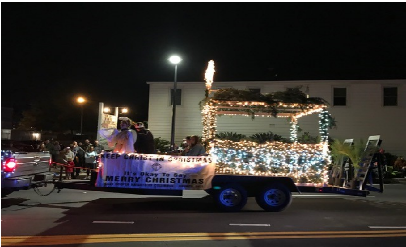
The only float advertising KEEP CHRIST IN CHRISTMAS with Mary, Joseph, Baby Jesus, an Angel and Wisemen provided by Christ Our King Youth Group.