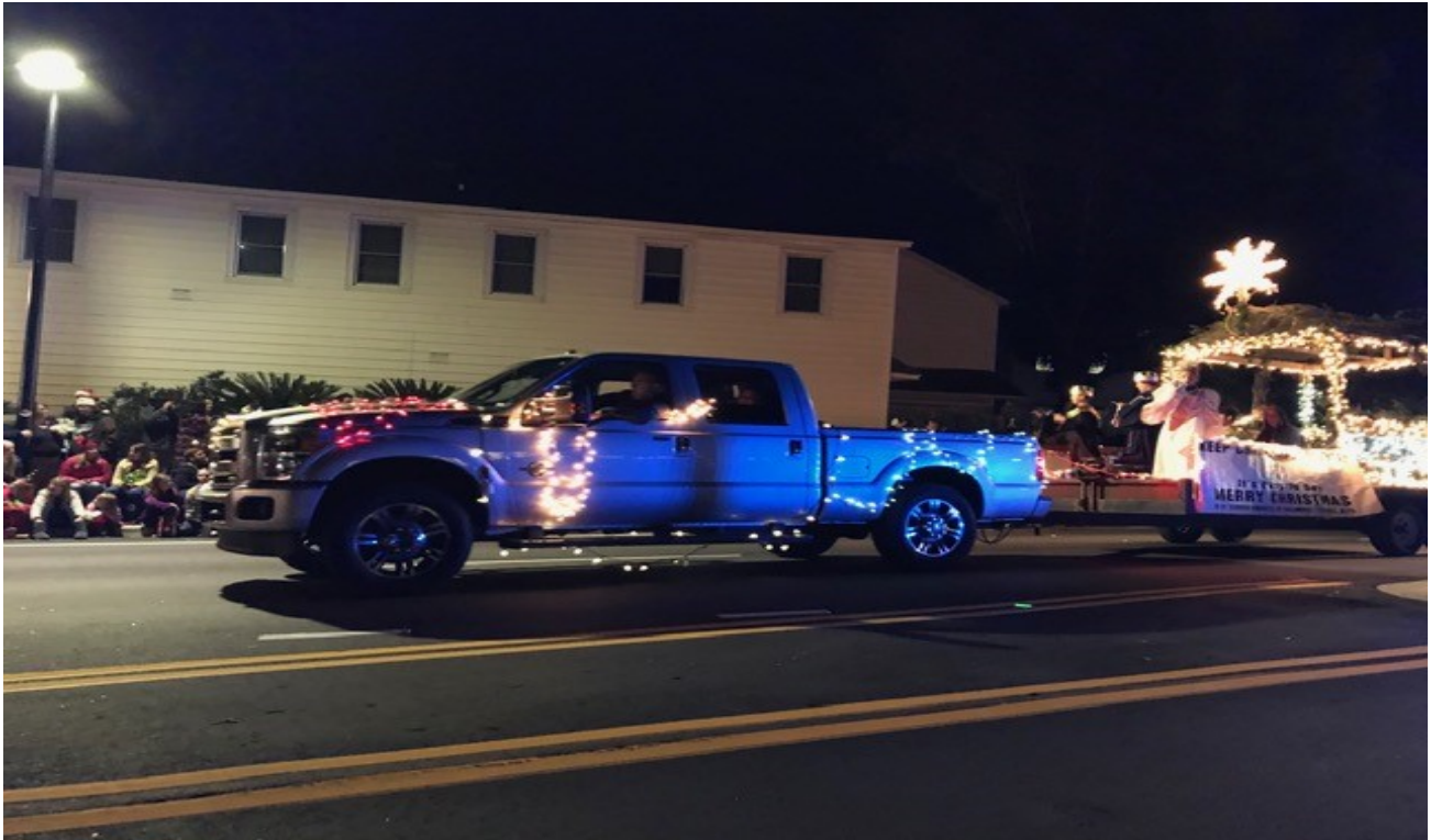
Here comes our float pulling it in truck is Past Grand Knight Kevin Cunnane