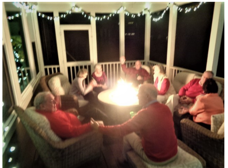
Enjoying each others company sitting around fire.