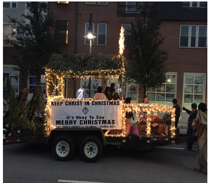
Side view of float