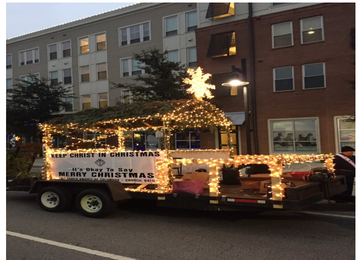
All lite up and ready to go.