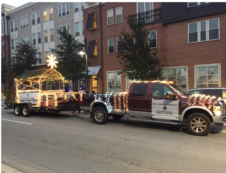
We earned 2nd Place with the Theme KEEP CHIRST IN CHRISTMAS