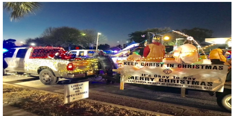
Our float is ready to participate in the parade Keeping Christ in Christmas!