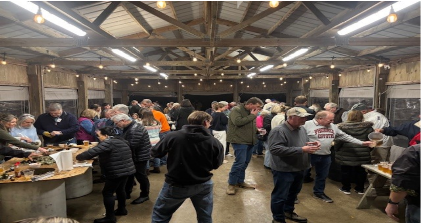
In this picture you can see everyone enjoying the oysters and beverages!