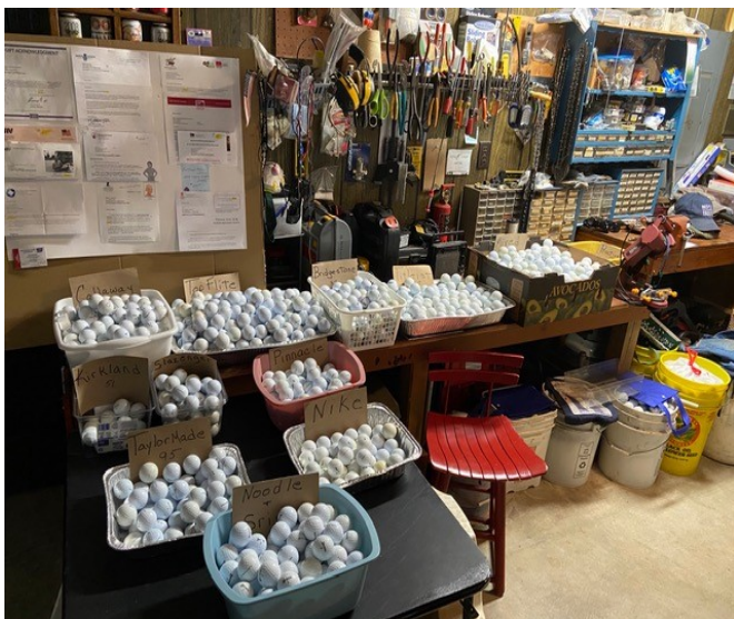
Above are containers of golf balls sorted by vendor .