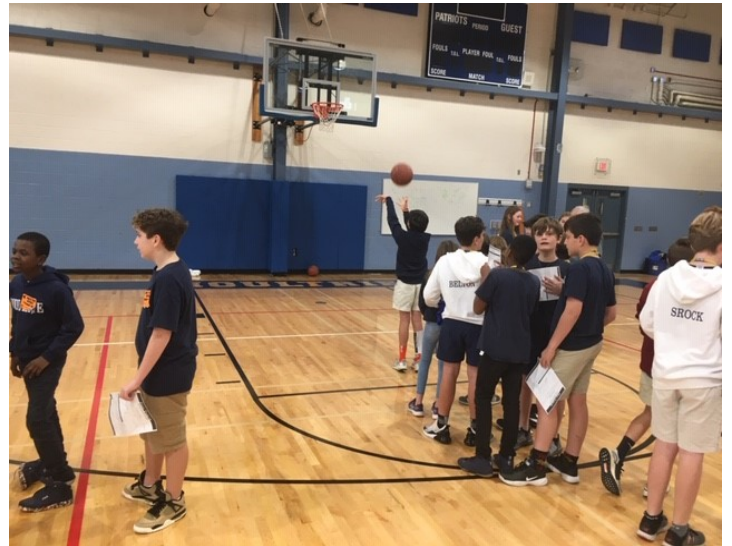
Students at Moultrie Middle School shooting basket as others wait in line for their turn. Same rules apply best out of 15 shoots.