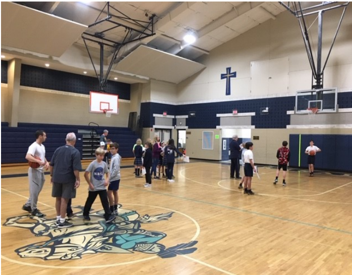
Students at COK/SM school getting instructions and shooting baskets best out of 15 shoots in our Free Throw Contest in their age group will move onto district Free Throw Contest.