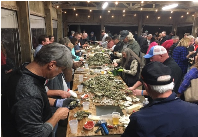
Here are serous oyster eaters.