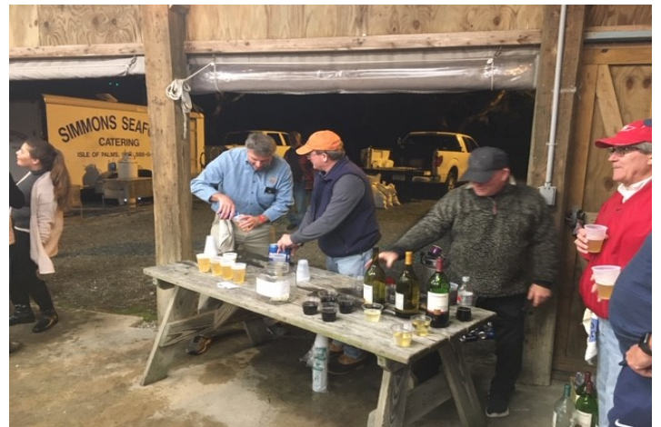
Here are the beverage crew. Looks like they are caught up with the costumers and getting rid of the empty containers.