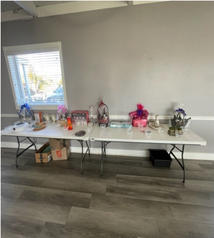
Donated items from Brother Knights took two tables to display them all.