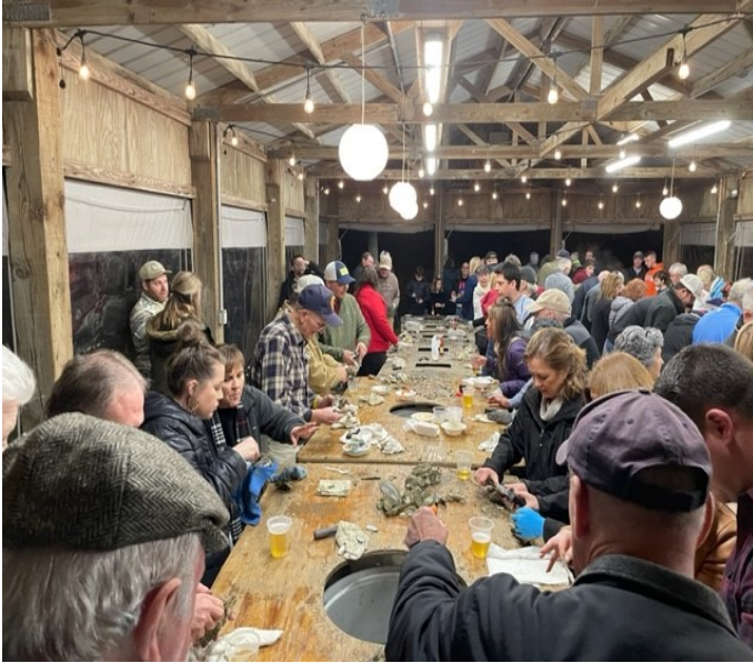
Left side of the oyster eating area racing the right side.