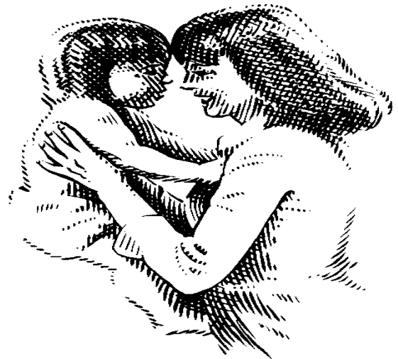
Stand-Up for Life