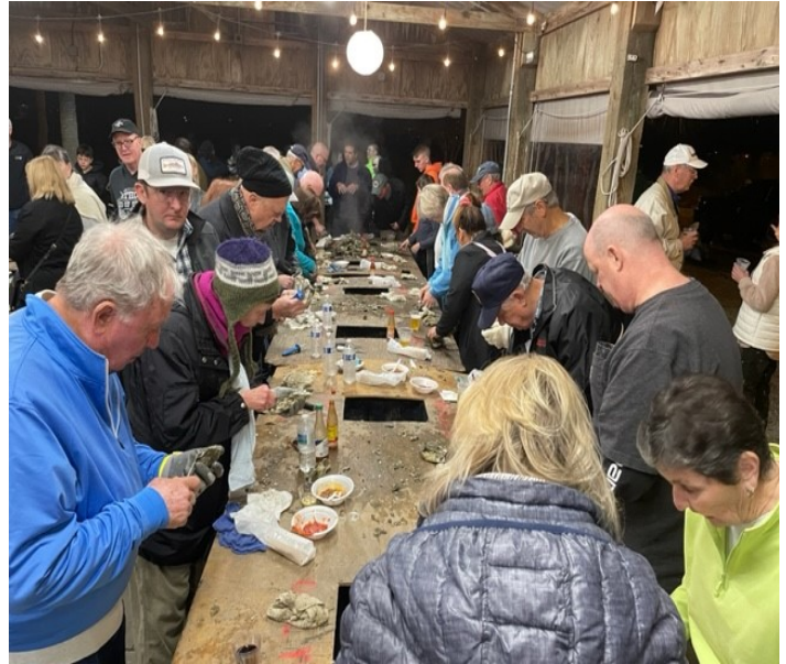
The right and left sides racing causing the oyster cookers problems keeping up. Smile!!!