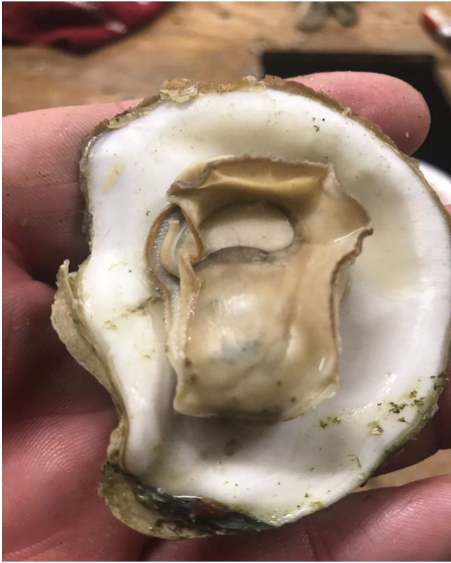
Now that's a good looking Oyster!