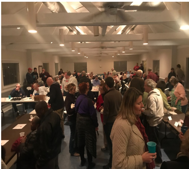
Sure looks like a good time was had by all.