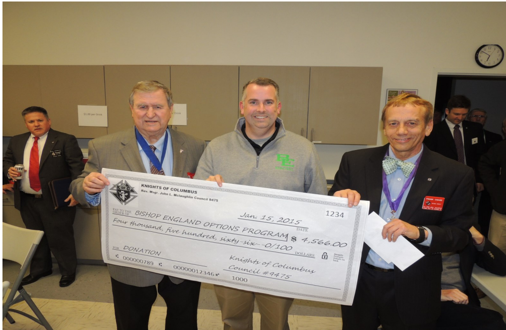
Council 9475 Donated $4,566.00 to Bishop England Options Program