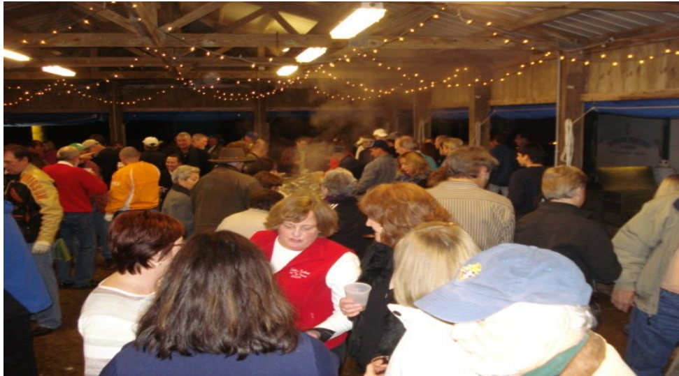
Patrons enjoying Oysters

To see all the pictures taken at the Oyster Roast go to KofC9475.org and click on Photo Album at top then under 2015 Events Click on Oyster Roast