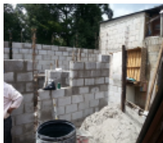
Day 4 at building site