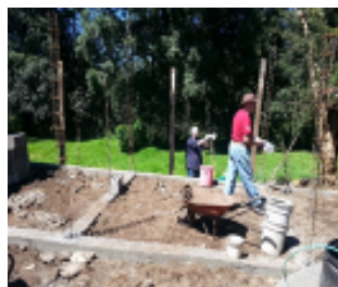
1 st Day at building site