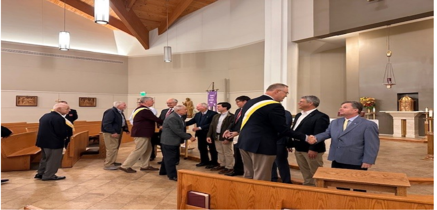
Above our new Brother Knights are lined up and being congratulated by all Brother Knights.

The exemplification was held before our regular meeting in the nave of St. Benedict's Church November 21, 2024