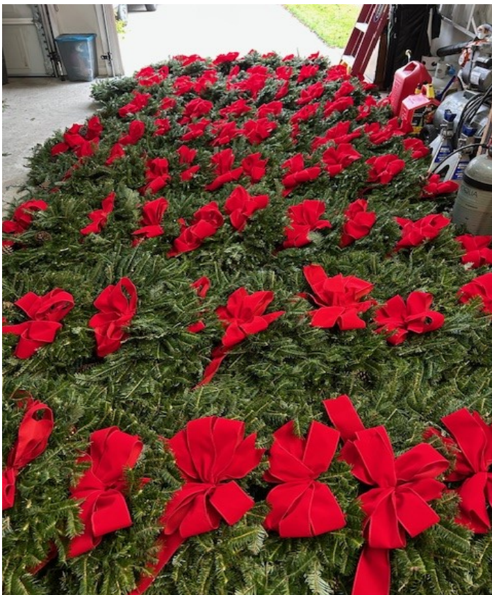
Here are the good part of a 150 wreaths ready for sale.