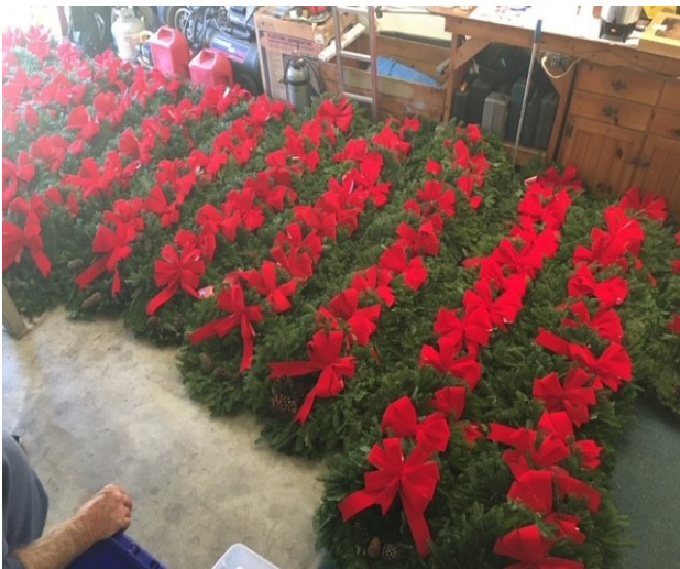
Above is about 100 of the completed decorated wreaths ready to be delivered to our sales tent.