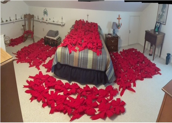
150 red wreath bows made and ready in frog waiting for wreaths to be delivered on Friday, Nov. 24.