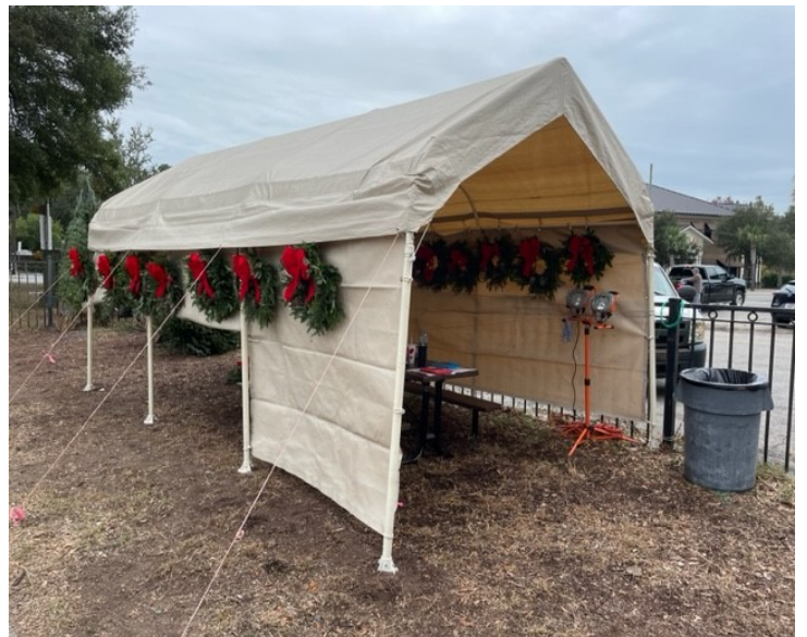
Above are wreaths delivered to our sales tent and we are ready for sales.