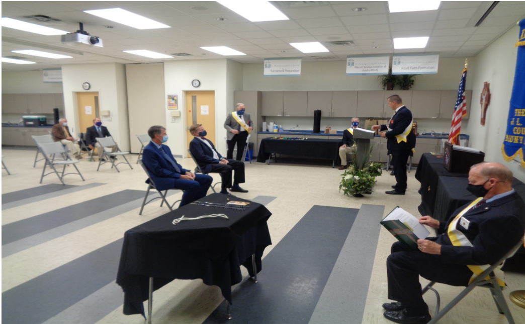
Above is Our Degree Team In Action