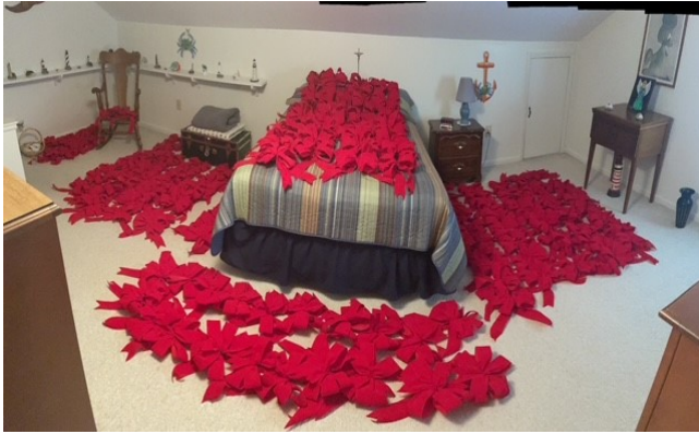
170 red wreath bows made and ready in frog waiting for wreaths to be delivered on Friday, Nov. 25.