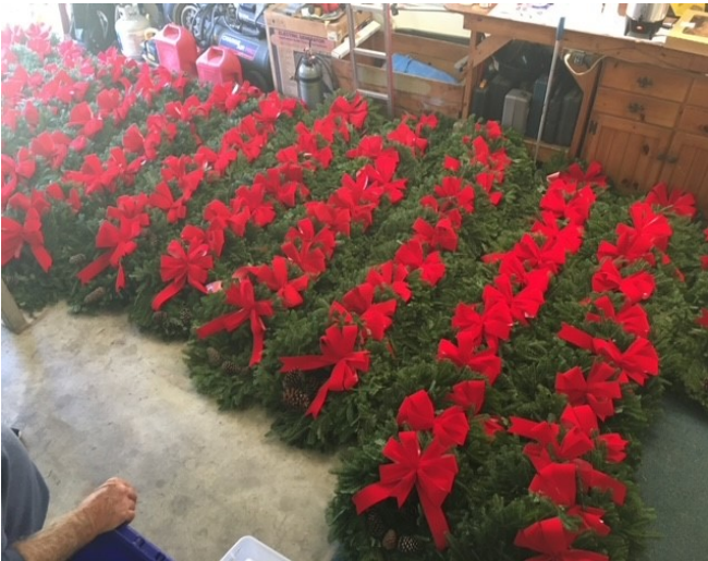
Above is about 100 of the completed decorated wreaths ready to be delivered to our sales tent.