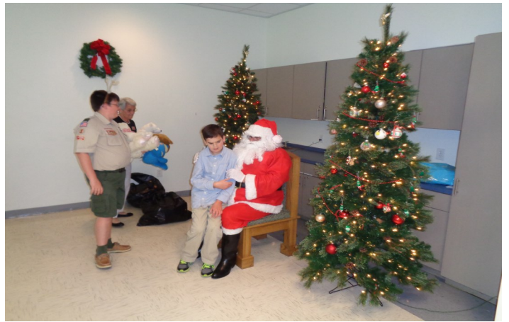
Talking with Santa