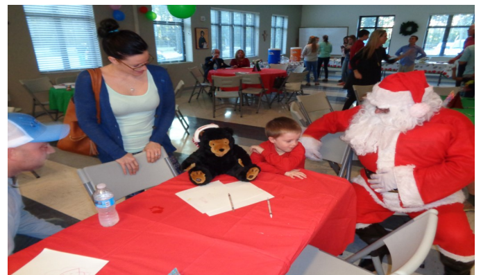
Santa gives child a stuffed animal sitting at table with parents looking on.