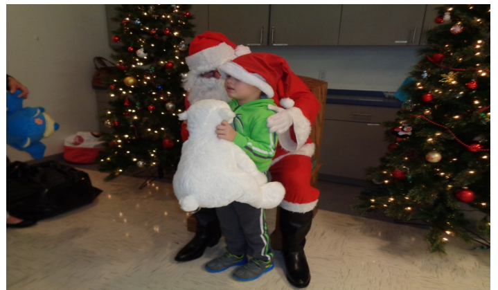
Getting a bear from Santa