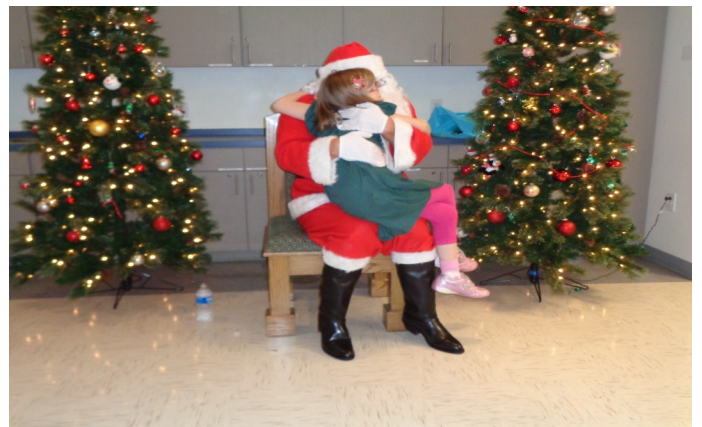
Giving Santa a Big Hug!