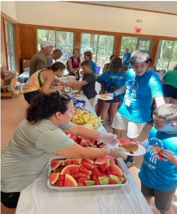
Above are Staff Members and Knights serving food to the campers and other staff members.