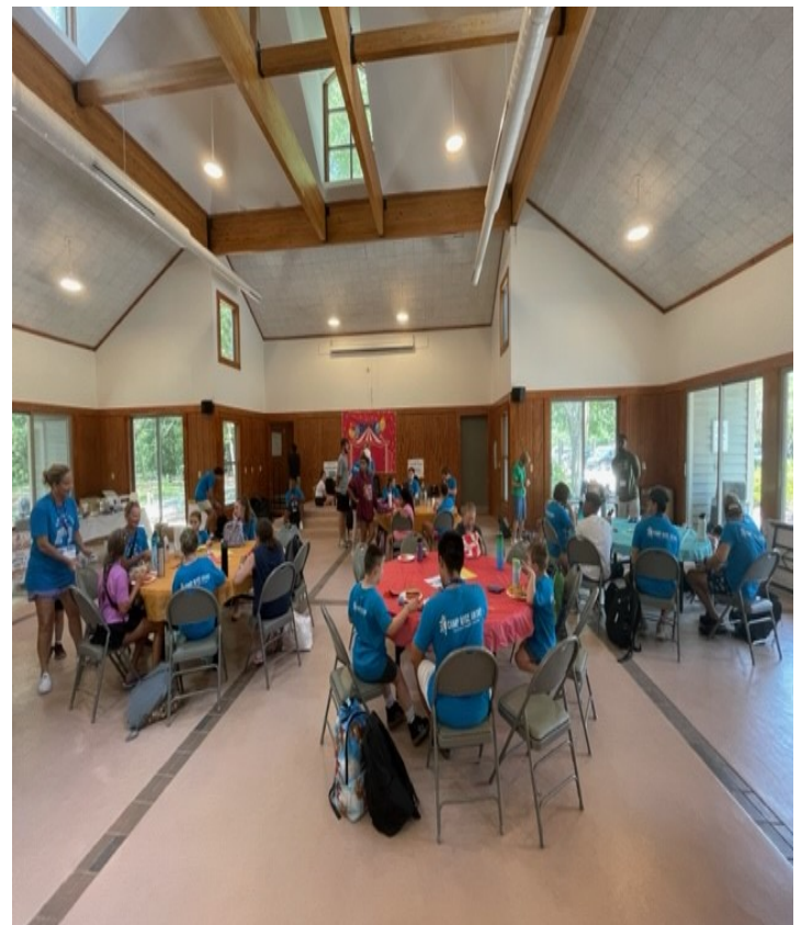
Above all are served and enjoying their meal.