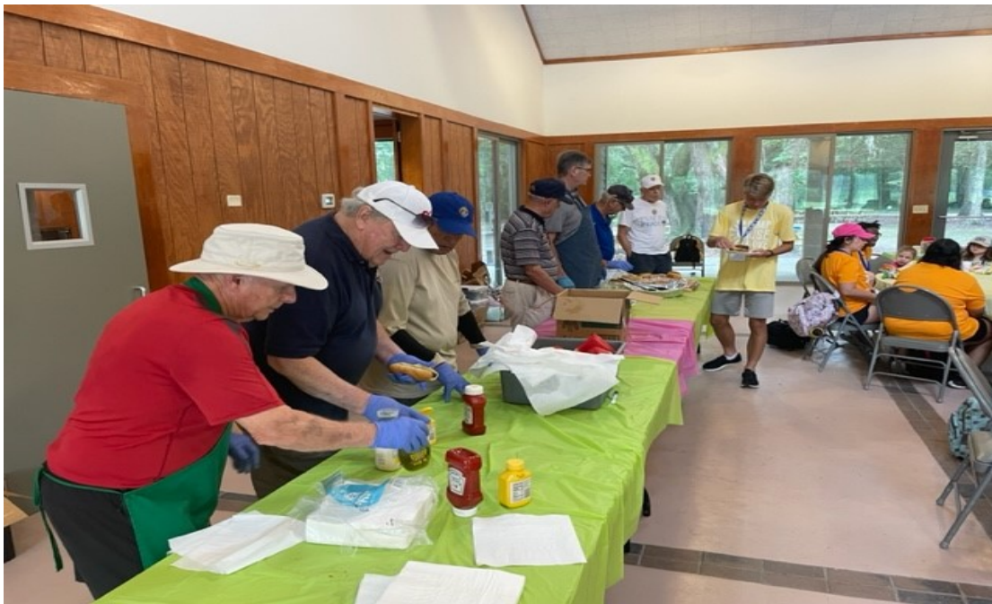
After cooking burgers and hot dogs the Knights moved inside to set-up and serve the food.