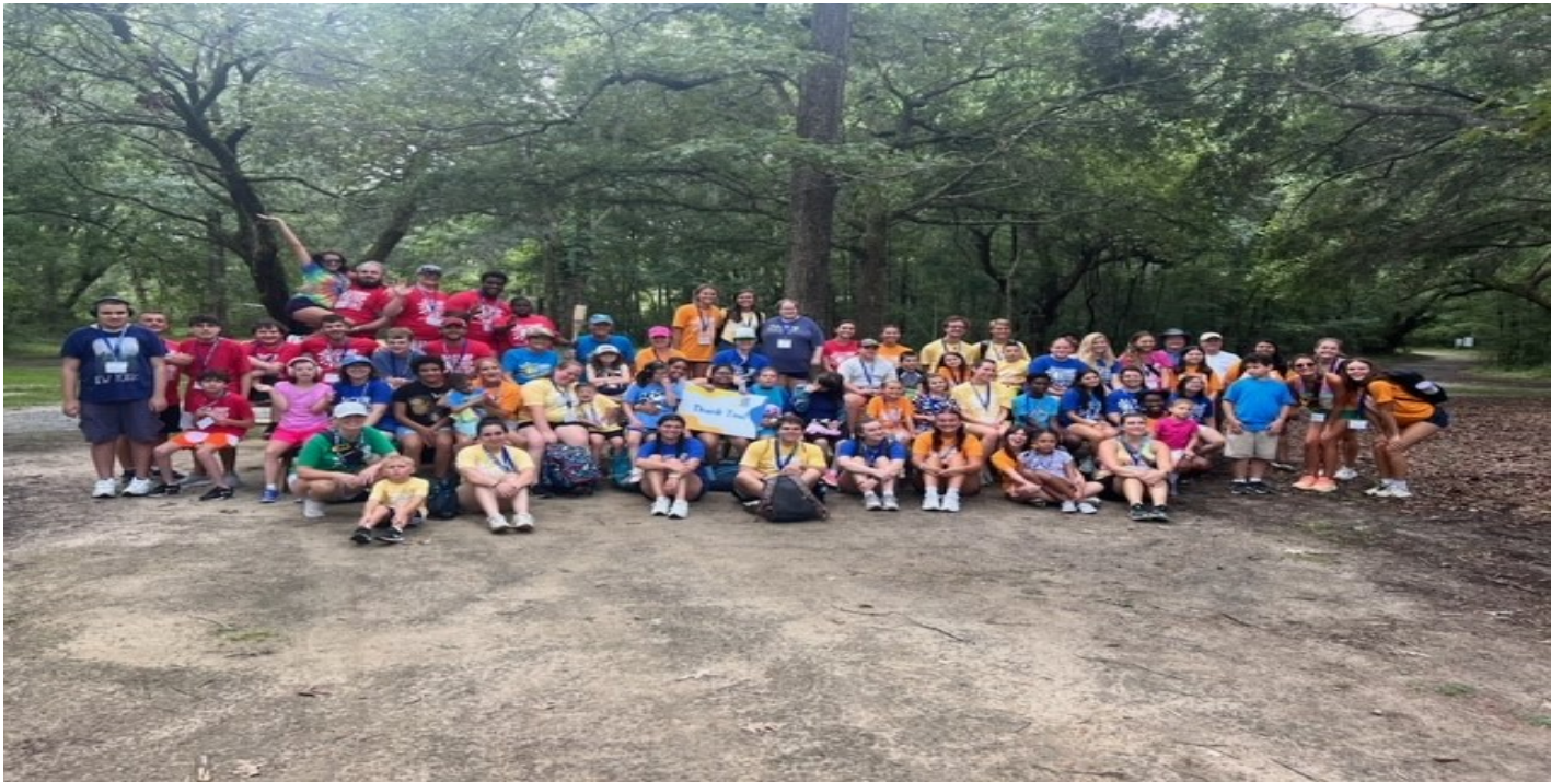
Above is a picture of Camp Rise Above counselors, campers and medical personnel.