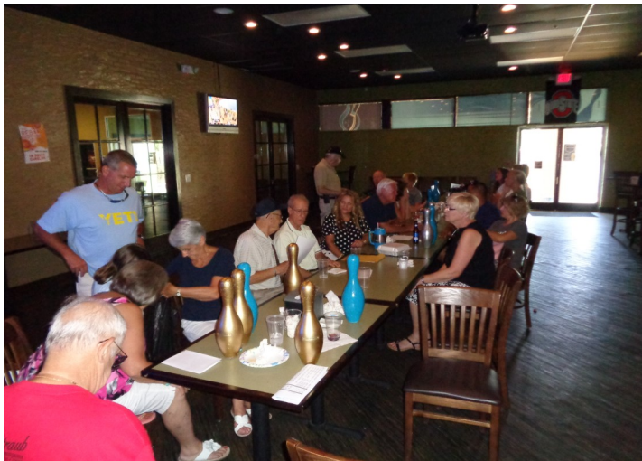
Having fun at Our Awards Banquet