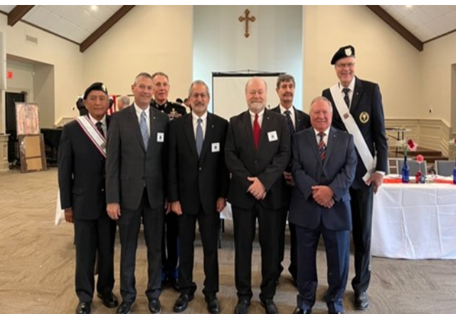
New Sir Knights with members of Assembly 3243.