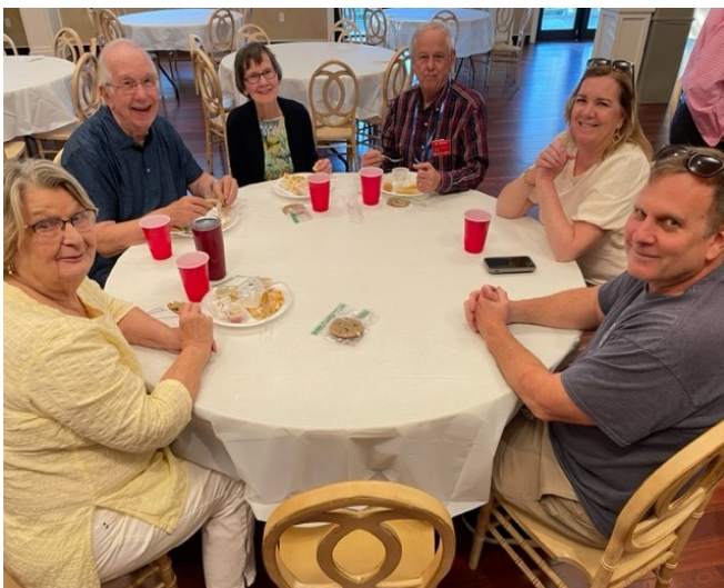
Here are a few Knights with wife's and friends enjoying each others company after eating their meal.